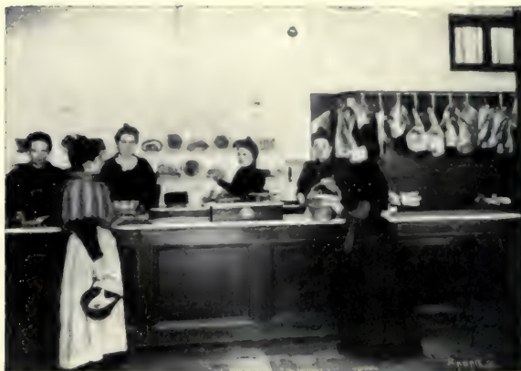
Fig. 18. BUTCHER'S SHOP.

Figure 18 shows us the butcher's shop in the morning when trade is brisk. Here also are sold sausages, preserved meats, and so on. Milk, fruit, and vegetables are sold in another room close by.